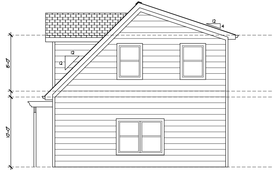
2 A-3 LEFT SIDE ELEVATION SCALE: 1/4"=1'-0"