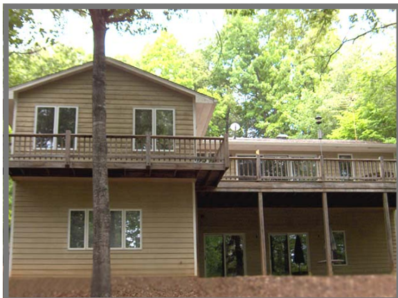
Deck off family room & master, as well as basement patio have beautiful views especially in winter