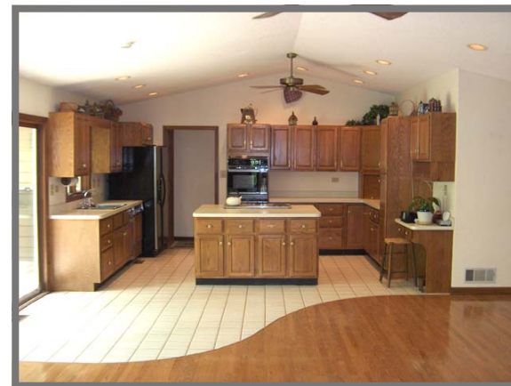
Massive kitchen with tons of storage, high-grade cabinets, desk and upgraded appliances

This information is deemed reliable, but not guaranteed.