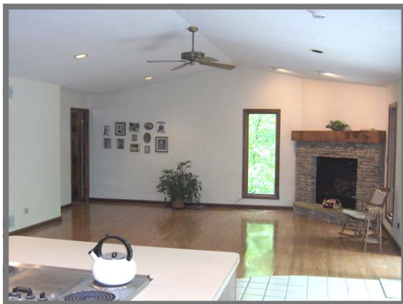
Huge family room with stack stone fireplace, hardwood floors, cathedral ceiling, deck and view