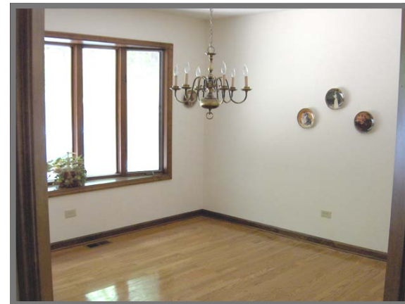
Dining room has bay window, hardwood floors and plenty of room for any dining set