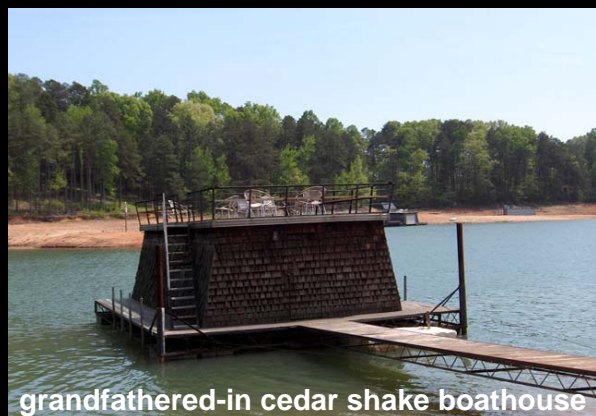
grandfathered-in cedar shake boathouse