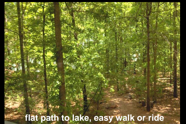
flat path to lake, easy walk or ride