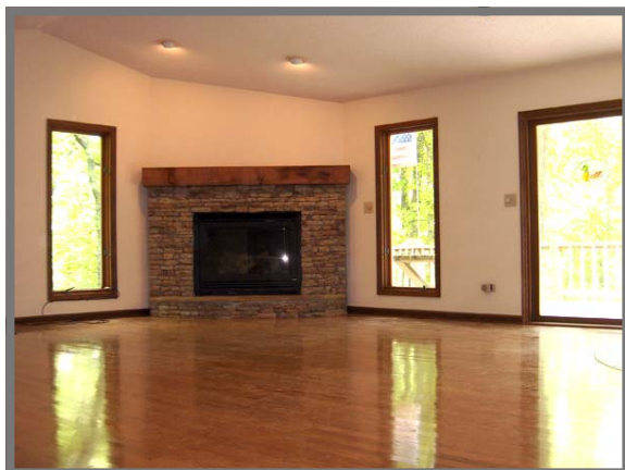
Exceptional construction including high/low vents, wiring inside conduit, extremely energy-efficient windows, extra insulation, dual zone HVAC...