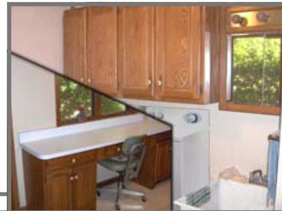
Terrific laundry/sewing room has sewing/work desk, sink and lots of cabinets (washer/dryer not included)